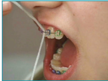
Remove plaque from braces