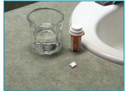
Take antibiotics before procedure

Infective endocarditis is an inflammation of the heart. It can damage the valves of the heart, the heart muscle, or the lining of the heart.